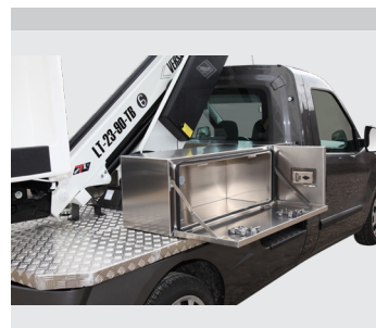
Aluminium cabinets for the chassis (optional)