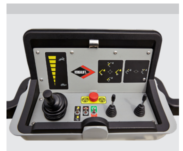
RLC (Relay Lefthand proportional Controls): Fixed outreach and 1 action at a time