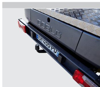
Tow bar (optional)