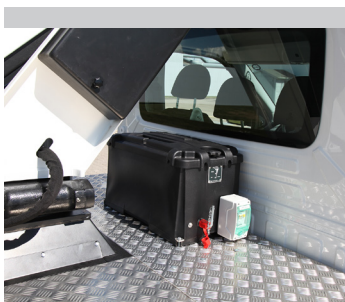
Hybrid version (optional)