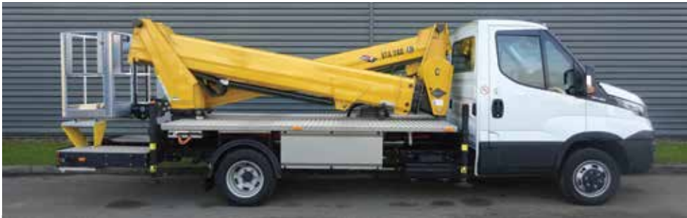
Low travel height