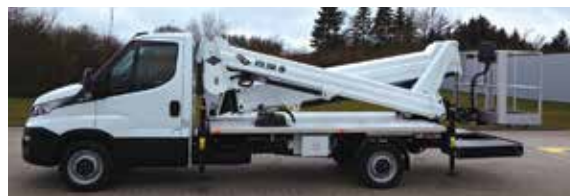
Available on 3.5T GWV Mercedes Sprinter and 3.5T and 5.2T Iveco Daily