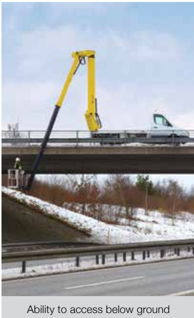
Ability to access below ground