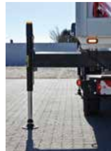
Compact H-frame outriggers